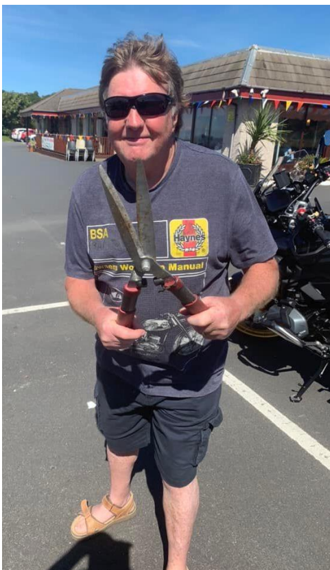
Our Chairman about to cause some mischief!