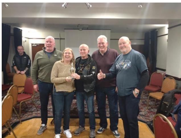
The winning team.

We all had an excellent night regardless of how well our team did and we left the club around 10pm, to a much dryer night than when we arrived.