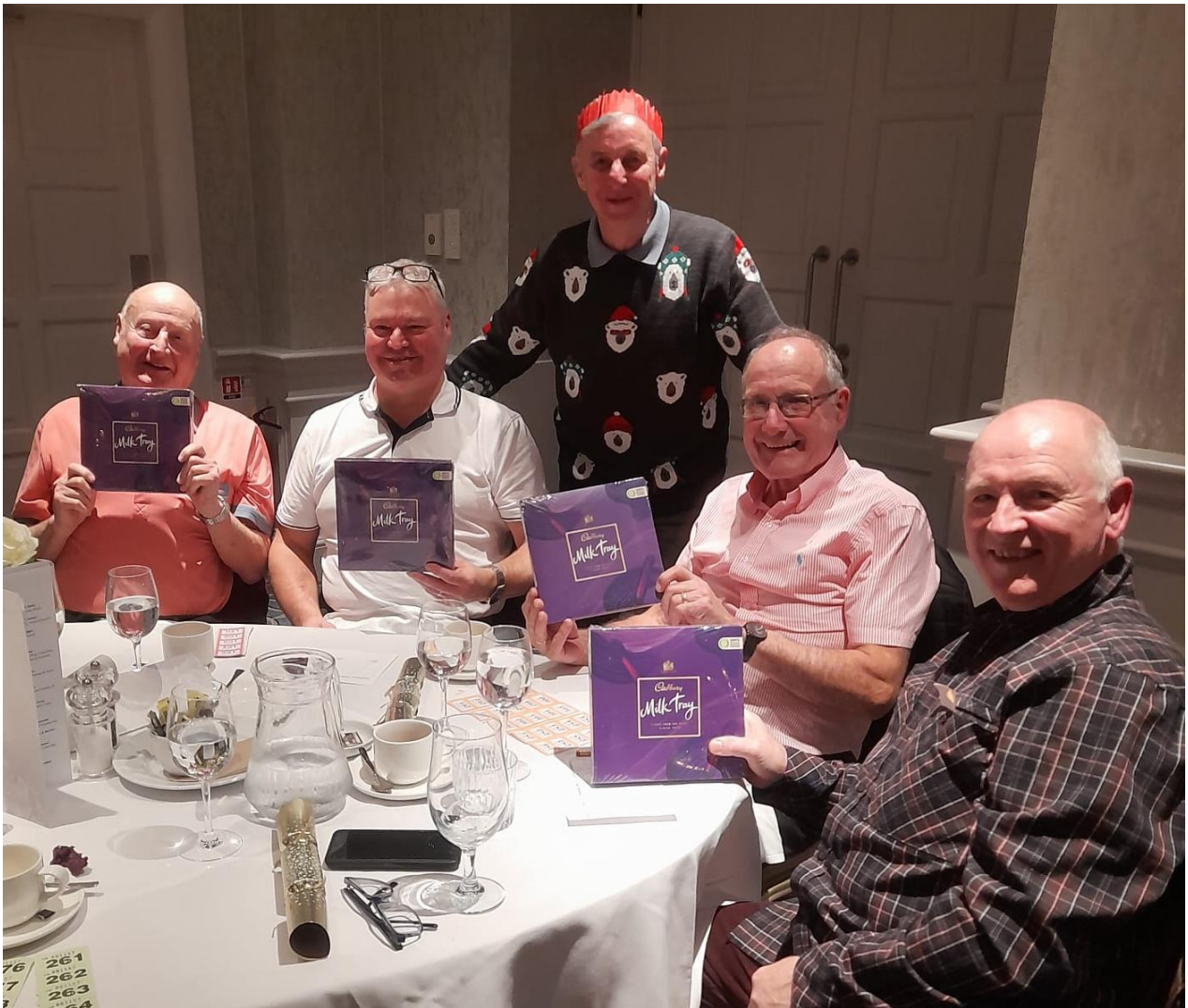
The members of the winning quiz team